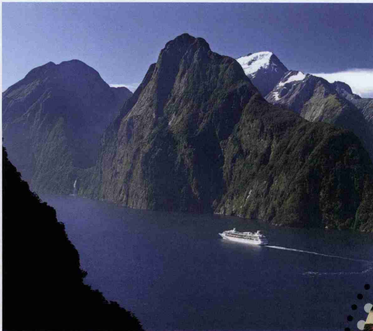
Milford Sound is one of New Zealand's natural wonders